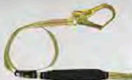
82423L 6' Looped Arc Flash with Rebar Hook