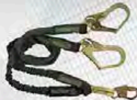
8243Y3 6' WeldTech® Internal with Rebar Hooks