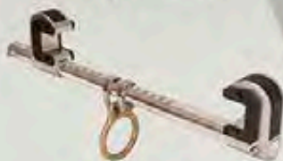
7531 12" Trailing Beam Clamp