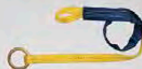
7448 Pour-in-Place Web Embed