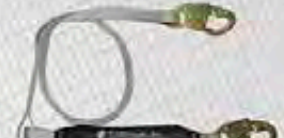
82856T 6' Titanium® Coated with Steel Snap Hooks