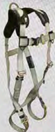
7008T 1D Standard Non-belted