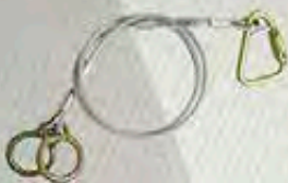
84202D 6' Cable Carabiner Sling