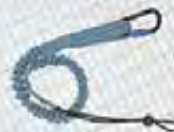
5027H 15lb Tool Lanyard Screw-Gate Carabiner