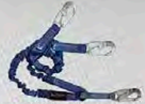
8240YA 4½' - 6' with Aluminum Snap Hooks