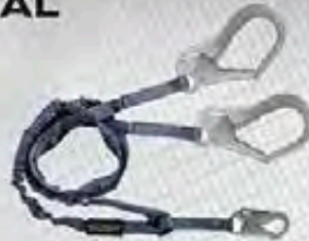
8259Y3 6' with Steel Rebar Hooks