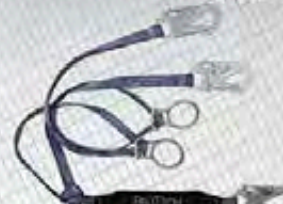
826082D 6' Tie-Back with Steel D-rings