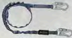
8259 6' with Steel Snap Hooks