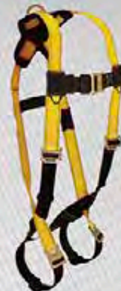
7021QC 1D Standard Non-belted