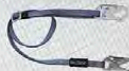
8209 4' - 6' Adjustable with Steel Snap Hooks