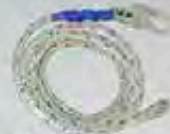
8150 50' Premium Polyester 5/8"