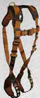
70805M 1D Standard Non-belted