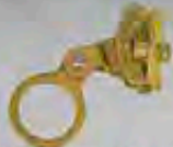
7479 Hinged Trailing Fall Arrestor