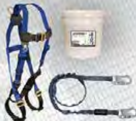
9500Z Harness and Lanyard Mini-Kit