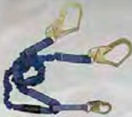
8240Y3 4½' - 6' with Steel Rebar Hooks