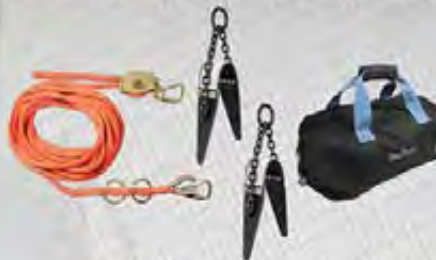
7493A502 50' 2-Person with Chain Anchors