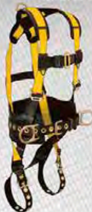
7035L 3D Belted Construction