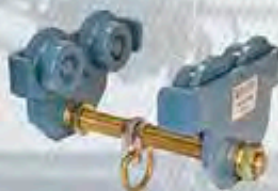
7711 8" Heavy Duty Beam Trolley