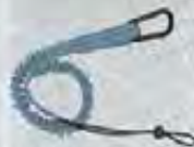
5027B 15lb Tool Lanyard Single Carabiner