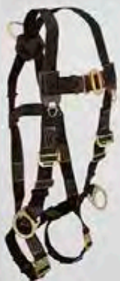
7039 3D Nomex Non-belted