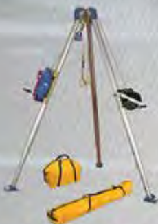
7504 6'-11' Retrieval and Winch Tripod Kit