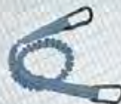
5027C 15lb Tool Lanyard Twin Carabiner