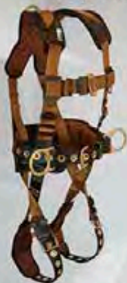
7081LX 3D Belted Construction