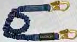
8240 4½' - 6' with Steel Snap Hooks