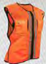
5056LX High-Vis Construction Vest Only