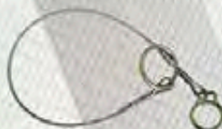
7428 6' Coated Cable Pass-through Sling