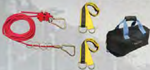
777075 75' 4-Person with Sling Anchors