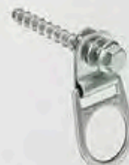
7451A Rotating D-Ring with Concrete Screw