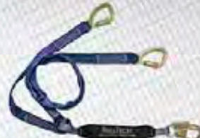
8241Y 6' WrapTech® Tie-Back with 5k Carabiners