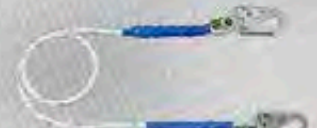
8156 6' Polyester Rope with Steel Snap Hooks