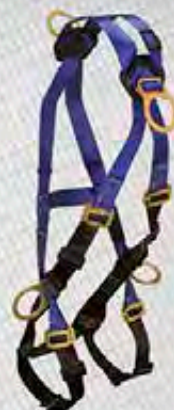
7019B 4D Crossover Climbing