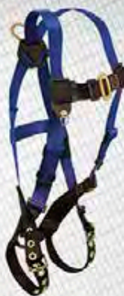
7016 1D Standard Non-belted