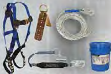
8595A Premium PFAS for Roofers