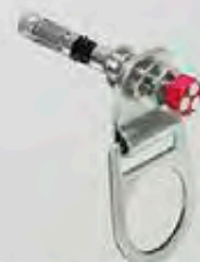
7451C Rotating D-Ring with Expansion Bolt