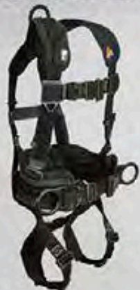
8073 3D Nomex Belted Construction