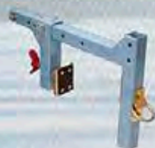
7460A Non-Penetrating Parapet Wall Clamp