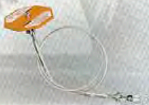
749485 8 1/2' Suspended Cable with Swivel-eye