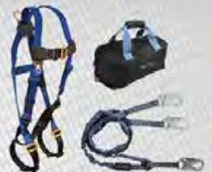
9017HS Harness and Lanyard User Kit