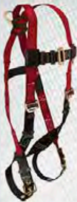
7008 1D Standard Non-belted