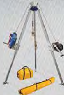
7503 6'-7' Retrieval and Winch Tripod Kit