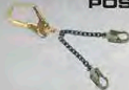
8250 Chain Swivel Rebar Assembly