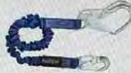
82403A 4½' - 6' with Aluminum Rebar Hook