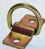
7414 Bolt-on D-Ring Plate