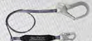
82563 6' with Steel Rebar Hook