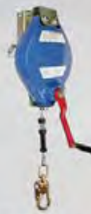
7283 60' Galvanized Cable Retrieval SRL