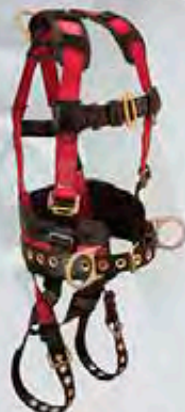
7078LX 3D Belted Construction