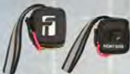
5040 Suspension Trauma Relief System