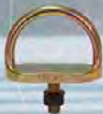
7435 Bolt-on Studded D-Ring