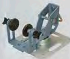
7395A Adjustable Rotating for SRDs