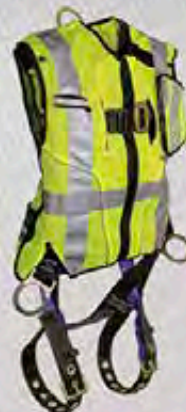
7018LXL 3D Class 2 Non-belted