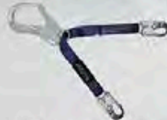
8250LTWA Web Aluminum Rebar Assembly