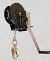
7290 60' Galvanized Cable Personnel Winch