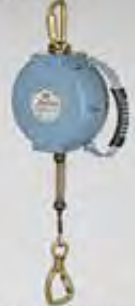
727630 30' Galvanized Cable