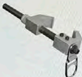
7535 12" Stationary Vertical Beam Clamp