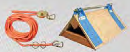
7432502 50' 2-Person with Roof Truss Anchors