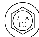
hex washer head