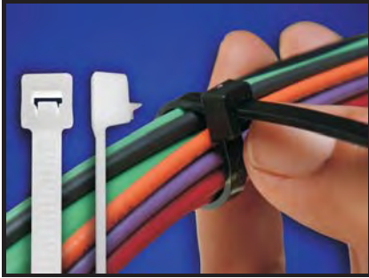
Extended Pawl Release