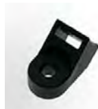
Heavy Duty Impact Resistant Screw Mounts

ACT ADVANCED CABLE TIES, INC. 245 Suffolk Lane, Gardner, MA 01440 Phone: 800.861.7228 - Fax: 978.630.3999 sales@actfs.com