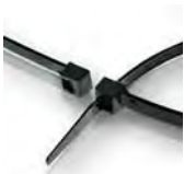
Impact Resistant Cable Ties