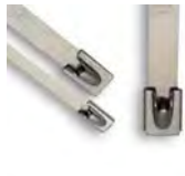
316 Stainless Steel Cable Ties