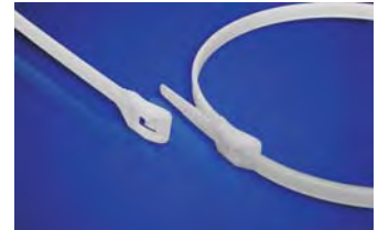
Pawl support is required to obtain optimum tensile strength.

Flexible head design provides maximum strength while the head easily flexes around the circumference of the tubing or bundled wires.