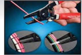
Patent 8,365,418 Precisely Strip 10 to 22 Gauge Wires

Remove cable ties & lacing without harming bundled items. Comfortable and easy to use.